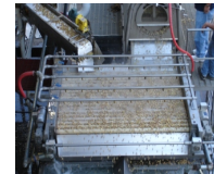
Pistachio Debris Remover