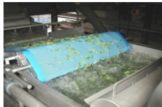
NEW! Jacuzzi Washline