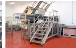
Hopper Belt Conveyors