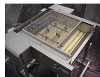
Potato & Fry Sliver Remover